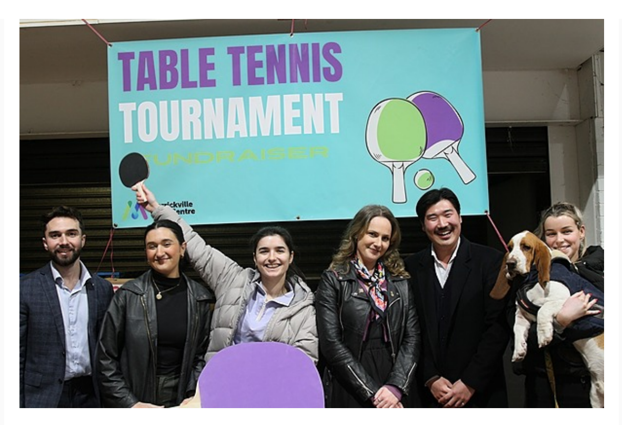
Pictured: Former MLC staff and representatives from our pro bono firms at our Inaugural Table Tennis Tournament Fundraiser in 2023.